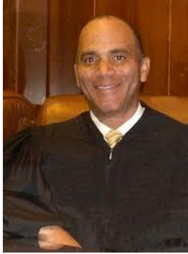
Wallace Jefferson ('85), former Texas Supreme Court Chief Justice who was the first African American to hold the post