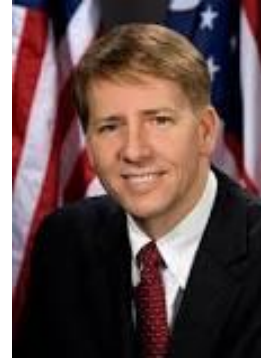
Richard Cordray (‘81) Director of the Consumer Financial Protection Bureau