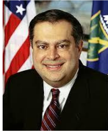
Former U.S. Senator and former U.S. Energy Secretary Spencer Abraham (‘74)