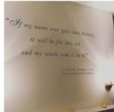
tkpkhome • 3 months ago

Great evening with @msuhonorscollege tonight to celebrate its 60th anniversary. Glad to hear they are making it a priority to support students of color and first generation students. #msuhonors #gogreen #spartanswill