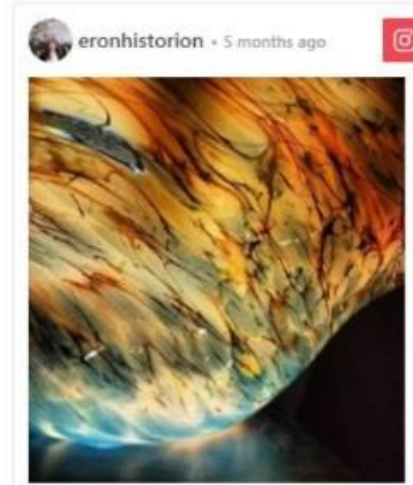
Chihuly Glass #msuhonors