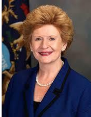
U.S. Senator Debbie Stabenow (‘72)